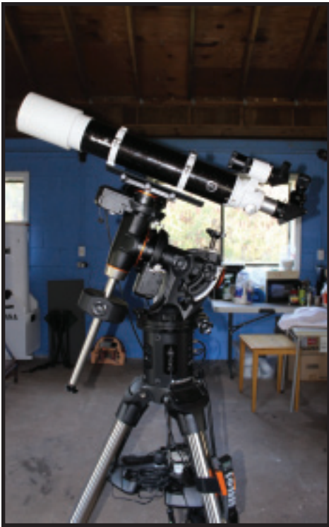
Image 6 - The ProED120 is shown mounted on a Celestron CGE Pro German equatorial mount.