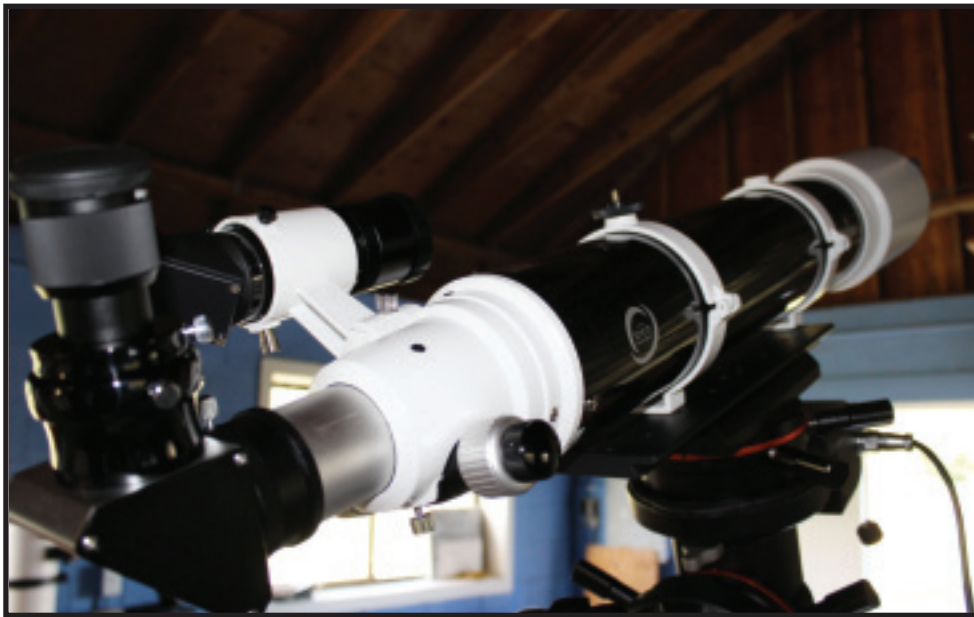
Image 5 - The OTA comes with a two-speed Crayford focuser.

any object I desired. While this mount is way overkill for this 11.3 pound OTA, it certainly made first light fun! Instead of a $4999 CGE Pro, for visual use I'd recommend a Celestron Advanced VX mount which lists for under $800. It operates the same as the CGE Pro, which was designed for a much larger payload.