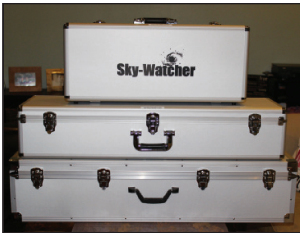
Image 1 - The William Optics GTF102 is shown mounted next to the GTF81 on which Dr. Dire previously reported.

The telescopes all arrived simultaneously; each packed in a thick cardboard box. Inside each box was an aluminum carrying case containing a telescope and an enormous quantity of accessories. Image 1 shows the three cases with the