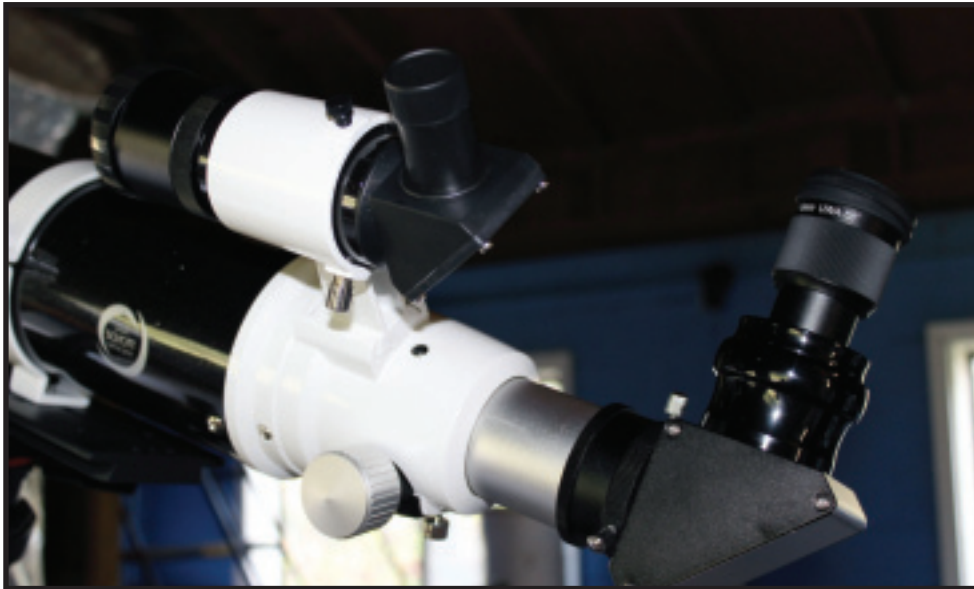
Image 4 - A mounting base for the finderscope bracket is cast into the focuser assembly