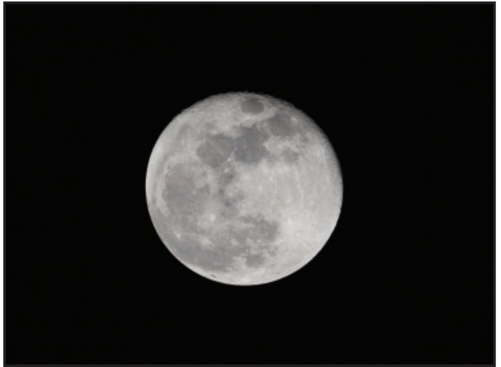
Image 7 - This image of a 16-day-old Moon was taken at prime focus with a Canon T3i camera. The exposure was 1/1000s.

16-day-old Moon was taken prime focus with a Canon T3i camera. The exposure was 1/1000s. Note the sharp crater detail on the limb from the 10 o'clock to 3 o'clock positions.