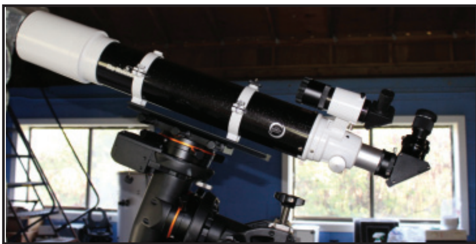
Image 3 - The ProED120 OTA features a black tube with gold speckles. The dew shield, focuser, finder brackets, and tube rings are eggshell white.

The OTA comes with a two-speed Crayford focuser ( Image 5 ). The focuser operates smoothly, but the feel is not