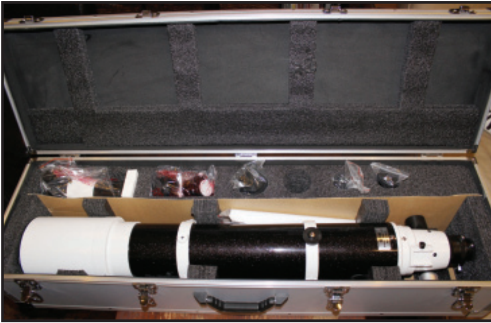
Image 2 - The ProED120 ships complete with an 8x50 image-erect finderscope and bracket, a dielectric 90-degree diagonal with a 2-inch compression ring clamp, and 2-inch to 1.25-inch adapter.

sive. Unlike most high-end amateur refractors on the market today, the Sky-Watcher ProED telescopes come with all